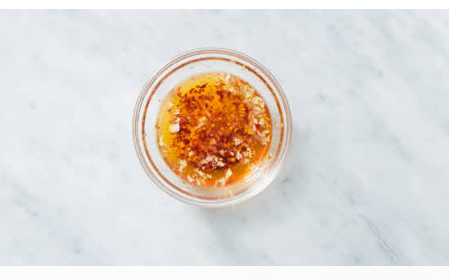
3. Make chili oil

Meanwhile, halve and thinly slice half of the onion (save rest for own use). Finely chop 2 teaspoons garlic . Remove Chinese broccoli leaves from stems . Stack leaves, roll like a cigar, then cut into ½-inch wide ribbons. Thinly slice stems on an angle into ½-inch thick pieces.