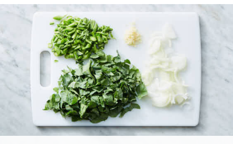
2. Prep ingredients

Bring a medium pot of water to a boil. Add noodles and cook, stirring occasionally to prevent sticking, until al dente, 6-8 minutes. Drain noodles, then rinse under cold water.