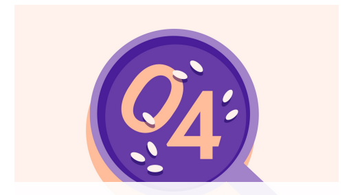
4. Assemble lasagna

Add tomato sauce, ½ cup water, and a pinch each salt, pepper, and sugar to same skillet. Bring to a simmer and cook until sauce is thickened to almost 2 cups, about 5 minutes. Stir in half of the Parmesan, then season to taste with salt and pepper. Transfer meat sauce to a measuring cup.