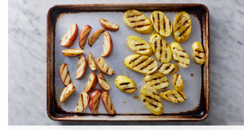
5. Grill vegetables

Preheat grill pan to high, if using. Brush grill or grill pan with oil .