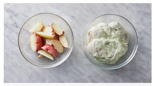
3. Prep chicken & potato

In a medium bowl, whisk together mayonnaise, sour cream, chives, tarragon, lemon zest and juice, and 1 teaspoon each of fish sauce and granulated garlic; season to taste with salt and pepper. Alternatively, for a greener color, blend in a blender until smooth.