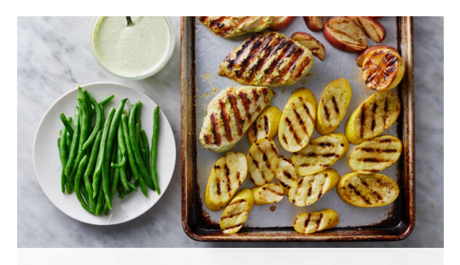
6. Grill chicken

Grill squash until tender and charred in spots, 3-5 minutes a side. Grill potatoes until charred and crisp, 3-5 minutes a side. Cook vegetables in batches as necessary; transfer to a plate.