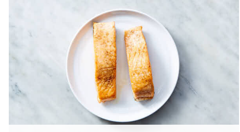
5. Cook chicken

Pat chicken dry, then season all over with salt and pepper . Lightly dust both of each fillet with flour , pressing lightly to help flour adhere.