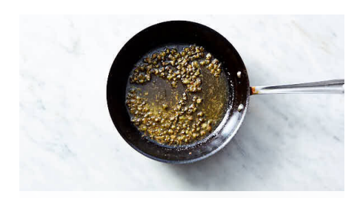
6. Make sauce & serve

Heat 1 tablespoon oil in reserved skillet over medium-high. Add chicken and cook until golden brown and cooked through, 3-4 minutes per side. Transfer to a cutting board to rest, 5 minutes.