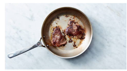
4. Cook steaks

On a rimmed baking sheet, toss broccoli with sliced garlic and 1 tablespoon oil ; season with salt and pepper . Roast on center oven rack until broccoli is tender and browned in spots, 8-10 minutes.