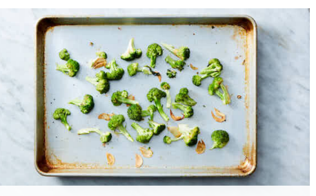
3. Roast broccoli

Preheat to 400°F with a rack in the center. To a small bowl, add 1 tablespoon butter and 1 teaspoon cowboy grilling rub ; set aside to soften until step 5. Cut broccoli into 1-inch florets, if necessary. Thinly slice 1 large garlic clove .