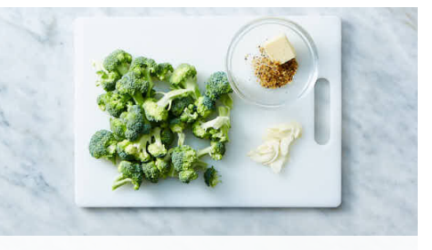
2. Prep ingredients

Peel potatoes , cut into 1-inch pieces, then place in a medium saucepan. Add 1 teaspoon salt and enough water to cover by 1 inch. Cover and bring to a boil, then uncover and cook until easily pierced with a fork, about 10 minutes. Reserve 14 cup cooking water , then drain and return potatoes to saucepan. Cover to keep warm.