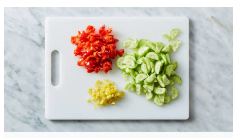
3. Make relish

Bake on lower oven rack until browned and tender, about 20 minutes. Transfer to a plate and cover to keep warm. Reserve baking sheet for step 6. Switch oven to broil.