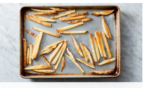
2. Roast potatoes

Scrub potatoes , then cut into ½-inch thick fries.