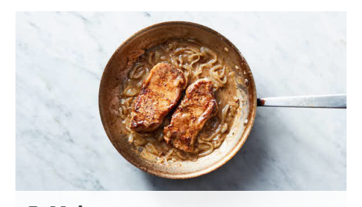
5. Make gravy

Pat pork cutlets dry, then sprinkle all over with salt , pepper , and 1½ teaspoons Cajun seasoning . Heat 1 tablespoon oil in reserved skillet over medium-high. Add pork and cook until browned and cooked through, 2–3 minutes per side. Transfer to a plate.