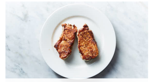
4. Brown pork cutlets

Bring water in saucepan back to a boil. Add grits in a steady stream, stirring constantly. Cover and cook over mediumlow heat, stirring occasionally, until tender and thickened, 4-5 minutes. Remove from heat, then stir in fontina and 1 tablespoon butter . Season to taste with salt and pepper . Cover to keep warm.