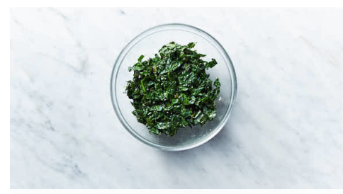
2. Sauté kale

In a small saucepan, bring 2 cups water and ½ teaspoon salt to a boil. Cover and keep warm over low heat. Halve and thinly slice all of the onion crosswise. Finely chop 1 teaspoon garlic . Strip kale leaves from stems; discard stems. Roll leaves up like a cigar, then thinly slice crosswise.