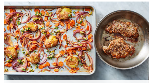
6. Cook pork & serve

Into bowl with lemon zest, stir to combine chopped parsley and pistachios, 1 tablespoon oil, and a pinch of salt.