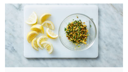
5. Prep garnish

Using a sturdy cup (or smooth side of meat mallet), gently press potatoes to lightly smash. Drizzle any remaining harissa oil from saucepan over. Roast on lower rack until lightly browned, about 15 minutes.