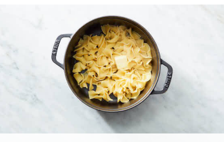
2. Boil pasta

Heat 1 tablespoon oil in same skillet over medium-high. Add mushrooms and a pinch each of salt and pepper . Cook, stirring occasionally, until tender, 2-4 minutes. Reduce heat to medium.