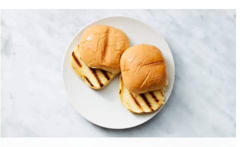
3. Toast buns

In a small bowl, stir to combine mayonnaise, chopped cornichons, 1 tablespoon ketchup, 1 teaspoon vinegar, ¼ teaspoon salt, and a few grinds of pepper. Set thousand island dressing aside until step 6.