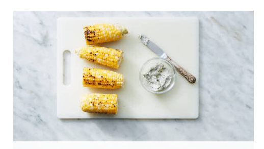
4. Grill corn

Preheat a grill pan over medium-high, if using. Drizzle oil over cut sides of buns . Place on grill or grill pan, cut side down, and cook until toasted, 2-3 minutes (watch carefully as buns burn easily). Transfer to plates.