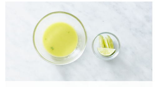
5. Make dressing

When cool enough to handle, cut corn kernels off cob; discard cob. Trim root ends from scallions , then chop crosswise on an angle into 1-inch pieces. Remove jalapeño stem, then halve lengthwise and discard seeds and inner membranes (or leave in if you like it spicy!).