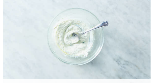
5. Season sauce

Meanwhile, heat 1 tablespoon oil in a medium skillet over medium-high. Add pork ; sear until browned on one side, 2-3 minutes. Flip pork, then transfer skillet to the top oven rack and roast until firm to the touch, slightly pink, and 145°F internally, about 8 minutes. Transfer to a cutting board and let rest for 5 minutes.