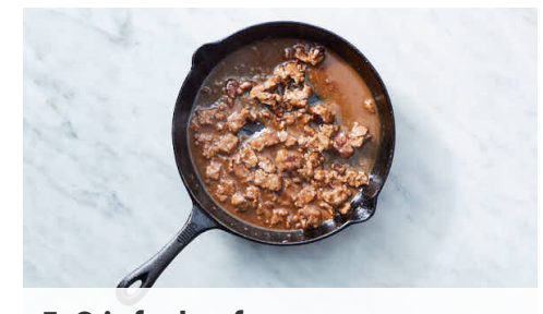
5. Stir-fry beef

In a small bowl, whisk to combine mayonnaise and all of the Sriracha (or less depending on heat preference).