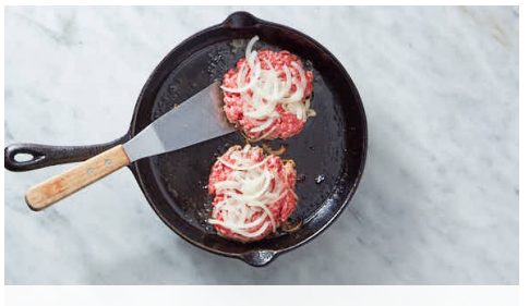
2. Cook burgers

Add all but 2 lettuce leaves and toss to coat.