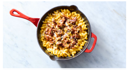
5. Broil & serve

Heat same skillet over medium; add drained pasta, all of the cheese sauce, and 3 tablespoons water. Combine until pasta is evenly coated. Season to taste with salt and pepper. Remove from heat. Sprinkle 3/3 of the shredded cheese over top. Pile barbecue chicken in the center, then top with remaining cheese.