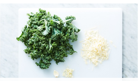
1. Prep ingredients

Calories 910kcal, Fat 40g, Carbs 78g, Protein 61g