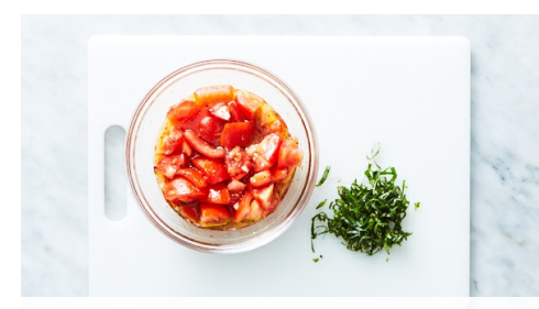
2. Make tomato-parsley salad

Strip kale leaves from stems , discarding stems, and coarsely chop leaves. Finely chop 1 large garlic clove . Coarsely grate all of the Parmesan on large holes of a box grater. Pat chicken dry; season with salt and pepper .