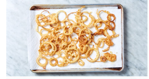
5. Fry onion rings

Broil on upper oven rack until well browned in spots and crispy, stirring halfway through, 8-10 minutes (watch closely as broilers vary). Add half of the barbecue sauce and 1 tablespoon water, tossing to coat.