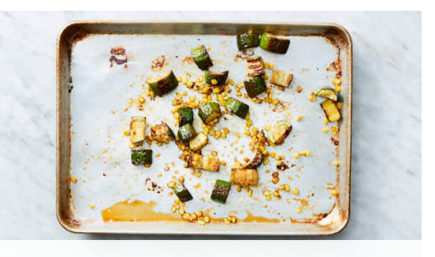
3. Broil zucchini & corn

On a rimmed baking sheet, toss zucchini with 1 tablespoon oil and season with salt and pepper . Broil zucchini on upper oven rack until browned in spots, about 5 minutes (watch closely as broilers vary).