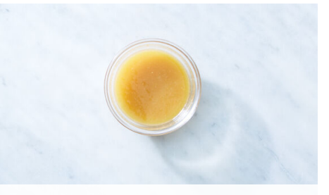
3. Prep pork & make glaze

Optional: broil pork, veggies , and apples for 1-3 minutes to further brown and crisp. Watch carefully to prevent burning.