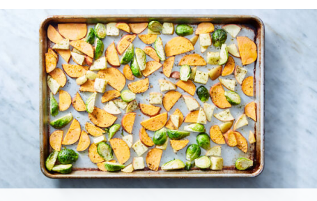
2. Roast veggies & apples

After veggies and apples have roasted 15 minutes, add pork to baking sheet. Spoon some of the maple-mustard glaze over pork (save the rest for serving). Roast until veggies and apples are tender and charred in spots and pork is cooked through to 145°F internally, 10-15 minutes.