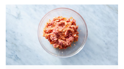
2. Make meatloaf

Transfer bread to a food processor, then pulse until the texture of coarse crumbs. Transfer to a medium bowl.