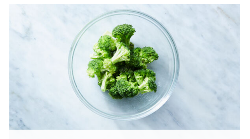
5. Steam broccoli

Meanwhile, peel potatoes , if desired, then cut into 1-inch pieces. Place in a medium saucepan with 1 teaspoon salt and enough water to cover by 1 inch. Cover and bring to a boil, then uncover and cook until easily pierced with a fork, about 10 minutes. Reserve ¼ cup cooking water . Drain potatoes and return to saucepan off heat; cover to keep warm until step 6.