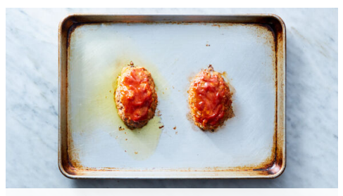
3. Bake meatloaves

Add carrots, onions, and celery to food processor. Pulse until finely chopped. Transfer to bowl with breadcrumbs. Add beef, mustard, 2 tablespoons ketchup, 1 teaspoon salt, and a few cracks of pepper. Mix to combine.