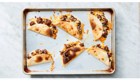
5. Broil quesadillas

Heat 1 tablespoon neutral oil in a medium skillet over high. Add beef ; cook, breaking up into smaller pieces, until cooked through and browned in spots, 4-5 minutes. Stir in remaining chopped garlic ; cook until fragrant, about 1 minute. Add glaze ; cook, scraping up browned bits from bottom of skillet, until beef is coated and skillet is mostly dry, 1-2 minutes. Season to taste.