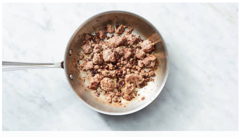
3. Brown beef

In a 2nd small bowl, stir to combine remaining gochujang and tamari, 3 tablespoons water, 1 tablespoon sugar, and 1 teaspoon sesame oil. Set glaze aside until step 3.