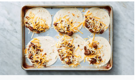
4. Assemble quesadillas

In a medium bowl, toss cucumbers with 2 teaspoons each of the chopped garlic, vinegar, and sesame seeds, 1 teaspoon each of tamari, sesame oil, and sugar, and ½ teaspoon salt. Set cucumbers aside until ready to serve.