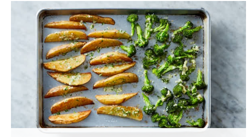
4. Finish vegetables

Scrub potatoes , then cut into wedges. On a rimmed baking sheet, toss potatoes with 1 tablespoon oil ; season with salt and pepper . Roast on lower oven rack until deeply golden underneath, 12-15 minutes. Cut half of the onion into ¼-inch thick rings (save rest for own use).