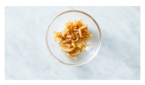
2. Caramelize onions

Flip potatoes ; push to one half of the baking sheet. Add broccoli to empty half; toss with 1 tablespoon oil and season with salt and pepper . Roast on lower oven rack until broccoli is tender and browned in spots, and potatoes are golden and crisp, 5-8 minutes. Mash garlic butter with a fork to blend. Add garlic butter to baking sheet and toss with potatoes and broccoli.