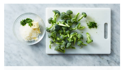
3. Prep ingredients

Heat 1 tablespoon oil in a medium skillet over medium. Add sliced onions ; season with salt and pepper . Cover and cook until onions are softened, 4-5 minutes. Uncover and cook, stirring, until deeply browned, 6-8 minutes (to prevent onions from sticking, add 1 tablespoon water at a time, as needed). Transfer to a bowl. Wipe out skillet and reserve for step 5.