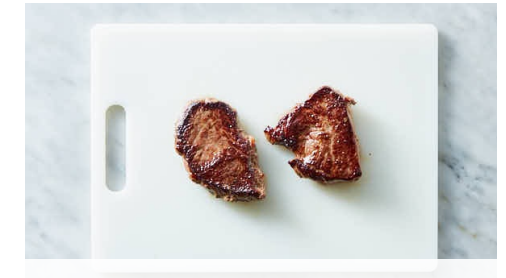
5. Cook steaks

Add Parmesan and 2 tablespoons each of parsley and butter to bowl with garlic; set aside to soften butter at room temperature. Cut broccoli into 1-inch florets, if necessary.