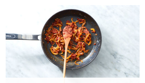
3. Cook aromatics

Pat pork strips dry, toss with 1 tablespoon flour , and season with salt and pepper . In a medium skillet, heat 1 tablespoon oil over medium-high. Add pork strips in a single layer. Cook, without stirring, until well browned on one side, about 3 minutes. Stir and continue to cook until pork is cooked through, about 2 minutes more. Transfer to a plate.