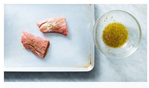
1. Marinate pork

Nutrition per serving Calories 870kcal, Fat 57g, Carbs 44g, Protein 47g