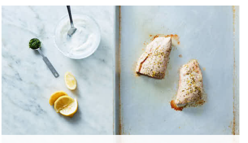
3. Cook pork & make tzatziki

In a medium bowl, combine zucchini, 1 tablespoon oil, and ¼ teaspoon of the grated garlic. Season with salt and pepper , and toss to combine.