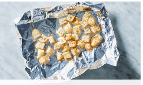
2. Make croutons

Preheat oven to 425°F with a rack in the center. Squeeze all of the lemon juice into a small bowl. Into a medium bowl, finely grate ½ teaspoon garlic and all of the Parmesan ; add 1½ tablespoons of the lemon juice (reserve remaining juice for step 5). Whisk in Dijon mustard , mayonnaise , and 1 tablespoon oil . Season to taste with salt and pepper ; set aside.