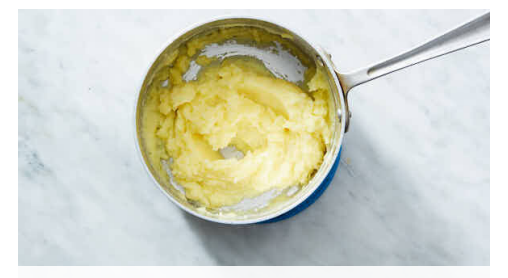
5. Mash potatoes

To same skillet, add garlic and cook, stirring, until fragrant, about 30 seconds. Add broth concentrate , figs , olives (first remove any pits, if necessary), 1 cup water , and 1 tablespoon of the oregano . Bring to a simmer, then return pork to skillet. Partially cover and cook, flipping pork halfway through, until pork reaches 145°F internally, 8-12 minutes.