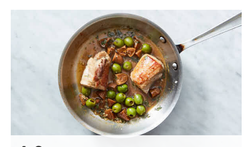
4. Start sauce

Pat pork dry, then season all over with salt and pepper . Heat 1 tablespoon oil in a medium skillet over medium-high. Add pork and sear until browned, about 3 minutes per side (pork will not be cooked through). Transfer to a plate.