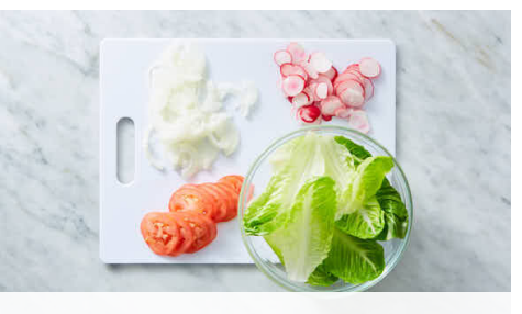
1. Prep ingredients

Calories 760kcal, Fat 47g, Carbs 43g, Protein 36g