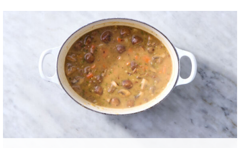
3. Add vegetables

Place bacon in a medium pot. Cook over medium-high heat, stirring occasionally, until golden brown and crisp, about 5 minutes. Add mushrooms ; cook until browned, 4-5 minutes.