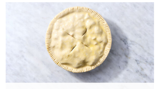
5. Assemble pie

Add onions, carrots, 2 tablespoons butter, and a pinch of salt to pot. Cook, stirring occasionally, until vegetables are softened, 3-4 minutes. Add garlic and rosemary; cook until fragrant, about 1 minute. Add ¼ cup flour. Cook, stirring frequently, for 2 minutes. Gradually add in 2 cups water, stirring frequently at the beginning to prevent lumps.