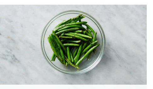
3. Cook green beans

Meanwhile, preheat broiler with a rack in the upper third. Finely chop 2 teaspoons garlic . Pat pork dry and season all over with salt , pepper , and paprika (start with ½ teaspoon and add more if desired). Trim stem ends from green beans .