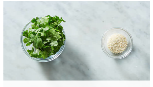
6. Chop cilantro & serve

Heat skillet with beef over high. Add snap peas , pasta squares , and 1 teaspoon of sesame oil . Stir-fry until just combined, about 1 minute. Add all of the stir-fry sauce , reserved cooking water , and 2 tablespoons vinegar . Stir-fry until pasta is coated in sauce, 2-3 minutes.