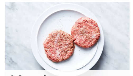
4. Season burgers

In a small bowl, stir to combine mayonnaise and horseradish ; season to taste with salt and pepper .