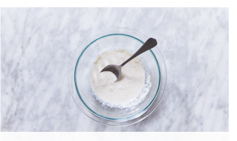
3. Make horseradish mayo

Trim scallions, then thinly slice. Trim ends from celery; halve lengthwise, then thinly slice crosswise. In medium bowl, stir to combine 2 teaspoons mustard, 2 tablespoons oil, 1 tablespoon vinegar, and a pinch each of sugar, salt, and pepper. Add potatoes, celery, and scallions to bowl with dressing; stir to combine. Season to taste with salt and pepper.