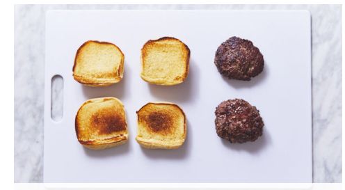
5. Toast buns & cook burgers

Form beef into 2 (4-inch) patties. Season all over with salt , pepper , and 1 teaspoon pastrami spice .