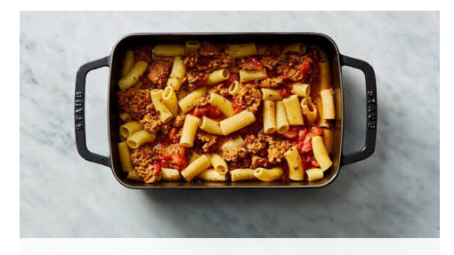
4. Assemble & broil

Add tomatoes and 1 cup water ; bring to a boil. Simmer over medium heat, stirring occasionally and crushing tomatoes with back of a spoon, until sauce is reduced by half, 10-12 minutes. Season to taste with salt and pepper .