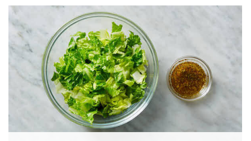
5. Make salad & serve

Broil on top oven rack until cheese is melted and brown in spots, about 5 minutes (watch closely as broilers vary).