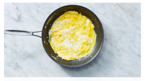
5. Cook omelette

Transfer fried rice to a small heatproof bowl, packing it down. Invert a serving plate on top of bowl with rice, then rotate both so that the bowl is sitting inverted on top of plate. Set aside until step 6. Wipe out skillet.