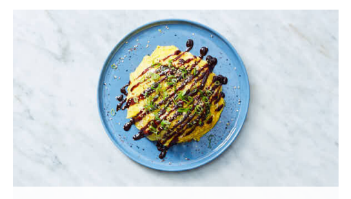
6. Assemble & serve

Heat 2 teaspoons oil in same nonstick skillet over medium until shimmering. Add eggs ; swirl to spread to edges of skillet. Cover and cook until eggs are set, 3-5 minutes. Remove from heat.