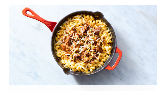
4. Make mac & cheese

Add 1 teaspoon oil and remaining scallions to skillet. Cook, stirring, until fragrant, about 1 minute. Add ¼ cup water and bring to a simmer, scraping up bits from the bottom of the pan. Add to bowl with pork. Stir in barbecue sauce until pork is evenly coated.