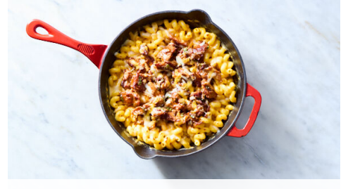
5. Broil & serve

Heat same skillet over medium; add drained pasta, all of the cheese sauce, and 3 tablespoons water. Combine until pasta is evenly coated. Season to taste with salt and pepper. Remove from heat. Sprinkle 3/3 of the shredded cheese over top. Pile barbecue pork in the center and then top with remaining cheese.