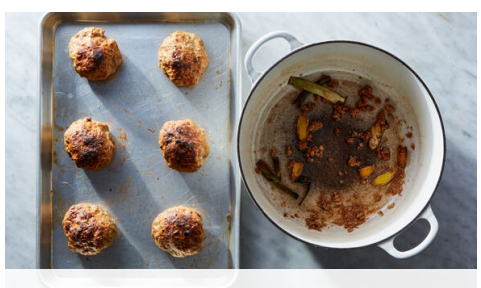
3. Broil meatballs

In a 2nd small bowl, whisk remaining cornstarch with 3 tablespoons water ; add to meatball mixture . Using a wooden spoon or hands, mix vigorously until stiffened, lightened in color, and somewhat sticky. Using wet hands, form into 6 large balls; transfer to an oiled rimmed baking sheet.