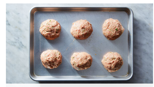
2. Form meatballs

Trim scallions; cut 1 into 2-inch pieces, thinly slice remaining. Finely grate 2 teaspoons ginger; thinly slice remaining. In a large bowl, combine pork, sliced scallions and ginger, 1 tablespoon each of tamari and mushroom seasoning, ½ tablespoon sesame oil, 2 teaspoons sugar, 1 teaspoon each five spice and salt, and 1 large egg.