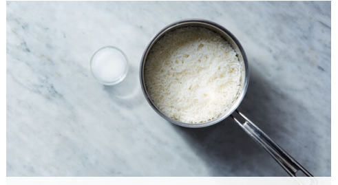
5. Cook rice

Separate bok choy into individual leaves; rinse well to remove any grit.