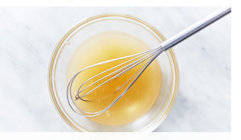
3. Roast veggies, prep broth

Trim and remove any outer leaves from Brussels sprouts , then halve lengthwise (or quarter, if large). Scrub carrots , then cut into ¼-inch thick slices on an angle. Finely chop 1½ tablespoons shallot ; quarter remaining shallot lengthwise. Finely chop parsley leaves and stems .