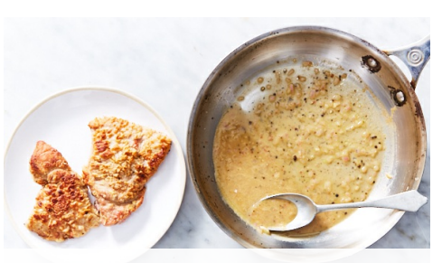
6. Make pan sauce & serve

Heat 1 tablespoon oil in a large skillet over medium-high until shimmering. Add pork , and cook, turning once, until cooked through and browned on each side, 7-8 minutes total. Transfer pork to a plate.