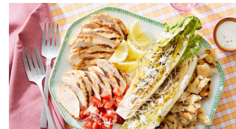
Plate lettuce alongside tomatoes and bread . Cut chicken into strips and place alongside. Drizzle dressing over top and garnish with remaining Parmesan and lemon wedges .

To remaining dressing , stir in half of the Parmesan and 2 tablespoons water .