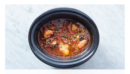
5. Add capers

Return potatoes to medium heat. Add ¼ cup butter ; mash with a potato masher or fork. Stir in 1 tablespoon reserved cooking water at a time to reach desired consistency. Season to taste with salt and pepper .