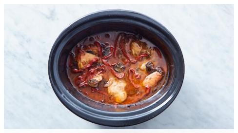
2. Cook cacciatore

In a measuring cup, whisk to combine all of the broth concentrate, cornstarch, 1½ teaspoons salt, ½ teaspoon sugar, and ¾ cups water.