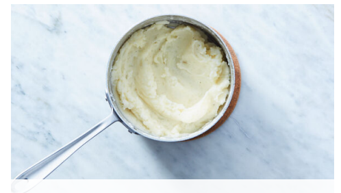
4. Mash potatoes

When the cacciatore has 45 minutes left cooking, peel potatoes (or scrub skins clean); cut into 1-inch pieces. Add to a medium pot with 1 teaspoon salt and enough water to cover by 1 inch. Bring to a boil over high heat. Cook until easily pierced with a fork, about 10 minutes. Reserve ½ cup cooking water ; drain and return potatoes to pot off heat.