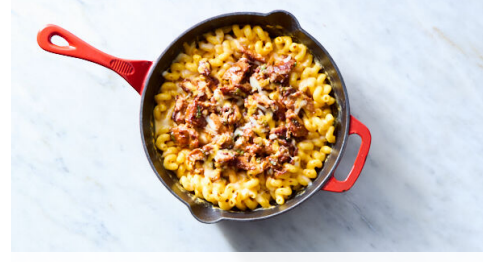
5. Broil & serve

Heat same skillet over medium; add drained pasta, all of the cheese sauce, and 3 tablespoons water. Combine until pasta is evenly coated. Season to taste with salt and pepper. Remove from heat. Sprinkle 3/3 of the shredded cheese over top. Pile barbecue pork in the center and then top with remaining cheese.