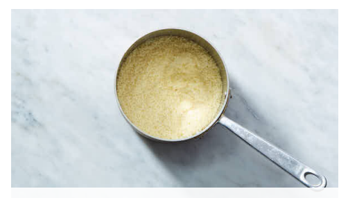
1. Make couscous

Calories 460kcal, Fat 15g, Carbs 39g, Protein 40g