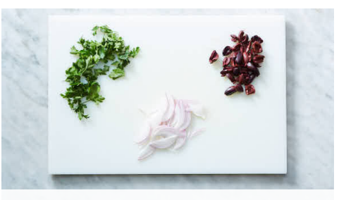
3. Prep salad

Meanwhile, pat steaks dry and season all over with salt and pepper . Heat 1 tablespoon oil in a medium heavy skillet (preferably cast-iron) over medium-high. Add steaks and cook until well browned all over and medium-rare, 3-5 minutes per side (or longer for desired doneness).