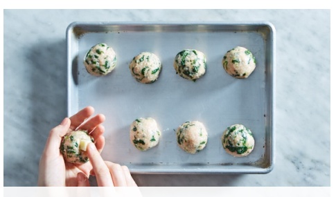
3. Make meatballs

Heat 1 teaspoon oil in a medium ovenproof skillet (preferably nonstick) over medium-high. Add half of the spinach, <sup>1</sup>/<sub>3</sub> of the chopped garlic , and 1 tablespoon water ; cook, stirring, until wilted, 1-2 minutes. Transfer to a finemesh sieve and press out excess liquid. Coarsely chop wilted spinach on a cutting board, then transfer to a medium bowl.