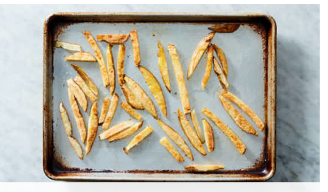
3. Roast French fries

In a medium bowl, stir to combine all of the Caesar dressing and all but 1 tablespoon of the Parmesan ; reserve for step 6.