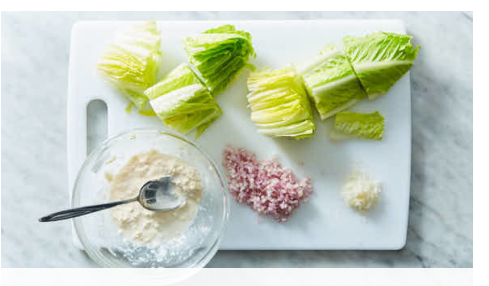
2. Prep salad & dressing

Pat steaks dry, then season all over with salt , pepper , and 2 teaspoons Italian seasoning . Heat 1 tablespoon oil in a medium heavy skillet (preferably castiron) over medium-high. Add steaks and cook until well browned and mediumrare, 2-3 minutes per side (or longer for desired doneness). Transfer to a cutting board to rest.