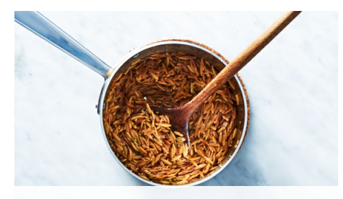
4. Cook pilaf

Add orzo and cook, stirring, until deep golden brown, 2-3 minutes.