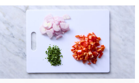
3. Prep ingredients

Place bacon in a medium skillet. Cook over medium-high heat until fat is rendered and bacon is crisp, 3-4 minutes per side. Transfer bacon to a paper towellined plate; reserve bacon fat in skillet.