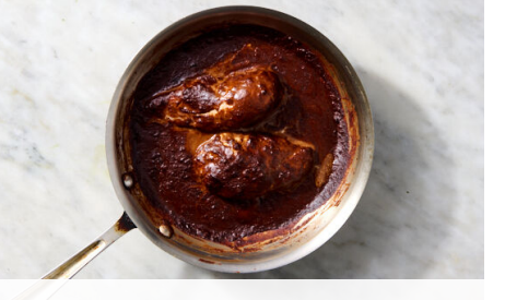
5. Bake chicken

In same skillet, heat 3 tablespoons oil over medium-high. Add half of the onions ; cook, stirring frequently, until lightly browned, 4-6 minutes. Add chopped garlic ; cook until just starting to brown, 1-2 minutes. Add 3 tablespoons cocoa powder . Cook, stirring constantly, until fragrant, 15-30 seconds.