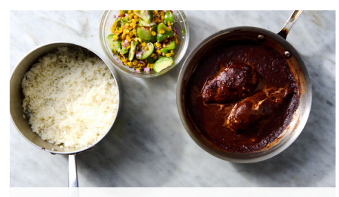
6. Finish salad & serve

Bake on center oven rack until just cooked through (internal temperature should register 160°F), 10-15 minutes. Let rest for 5 minutes.