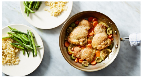
6. Reduce sauce & serve

Add orzo to boiling water and cook, stirring occasionally, until al dente, about 8 minutes. Drain through a fine-mesh sieve, return orzo to pot, and toss with 1 teaspoon oil or butter .