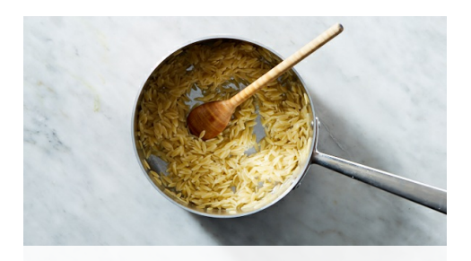
5. Cook orzo

Return chicken and any juices to skillet; season with pepper . Braise on upper oven rack until carrots are tender and chicken is cooked through to 165°F, 16-18 minutes.