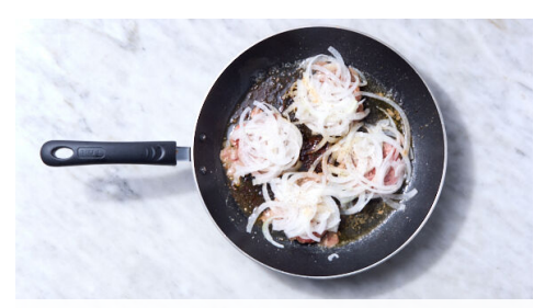
4. Smash burgers

In a large heavy skillet (preferably cast iron), melt 2 tablespoons butter over medium. Add buns , cut side down; swirl around skillet to absorb butter. Cook until light golden-brown and toasted, 1-2 minutes. Remove from skillet; wipe skillet clean. Right before cooking burgers, spread barbecue sauce on cut sides of buns. Arrange jalapeños on bottom buns.