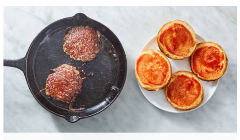
3. Toast buns

In a small bowl, combine all of the sour cream and half of the ranch seasoning (save rest for own use). Thin with water , 1 teaspoon at a time, to reach desired consistency. Season to taste with salt and pepper .