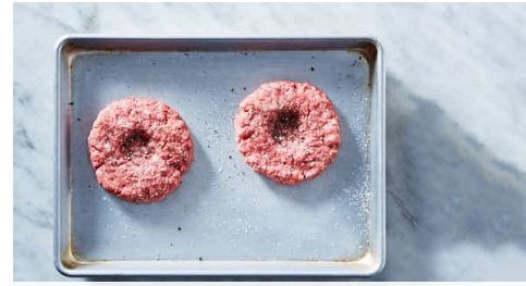
3. Prep turkey burgers

Add cilantro leaves and stems, corn, and chopped grilled onions and poblanos to bowl, tossing to coat.