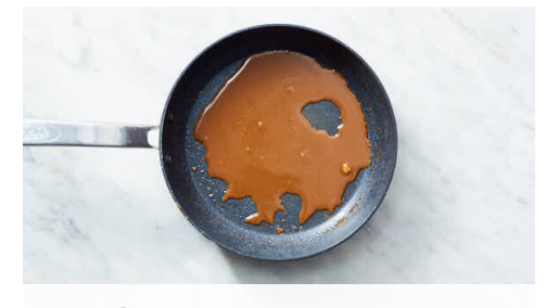
5. Make warm vinaigrette

Pat chicken dry and season all over with salt and pepper . Heat 1 tablespoon oil in reserved skillet over medium-high. Add chicken in a single layer and cook, undisturbed, until browned on the bottom, about 3 minutes. Stir and cook until cooked through, about 2 minutes more. Transfer to a plate.