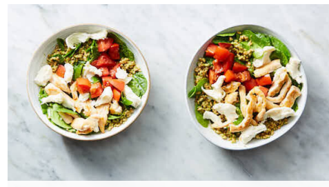
6. Assemble & serve

Remove skillet from heat. Add mustard and 1 tablespoon each of oil, vinegar, and water . Whisk until fully combined. Stir in 2 tablespoons water to thin. Season to taste with salt and pepper .